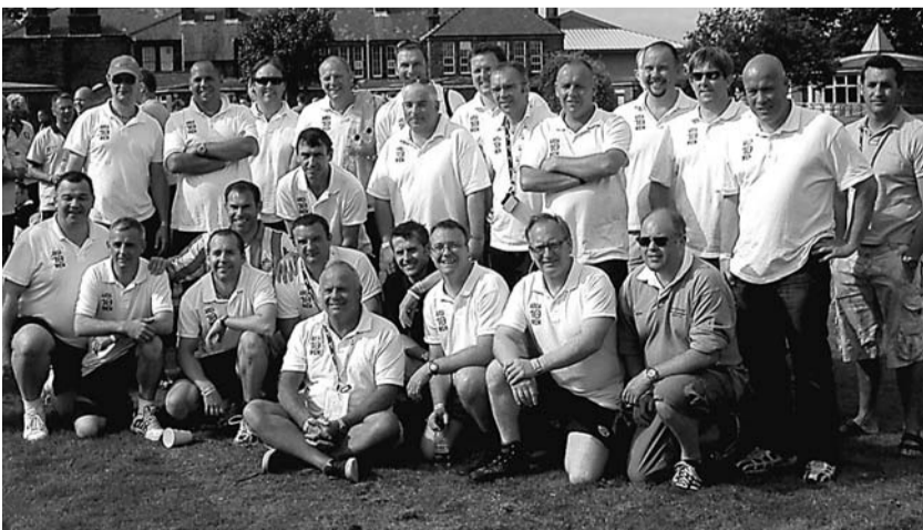
National Sporting Weekend winners at NSW 2010